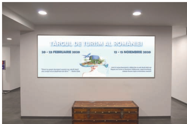
SNAP FRAME, SIZE 320X110 CM