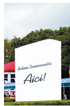
ADVERTISING MASCOTS DISPLAY