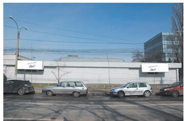
BANNER DISPLAY ON ROMEXPO HEADQUARTER FACADE