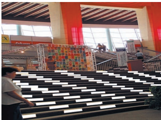
STICKERS DISPLAY ON PAVILION'S STAIRS AND FLOOR