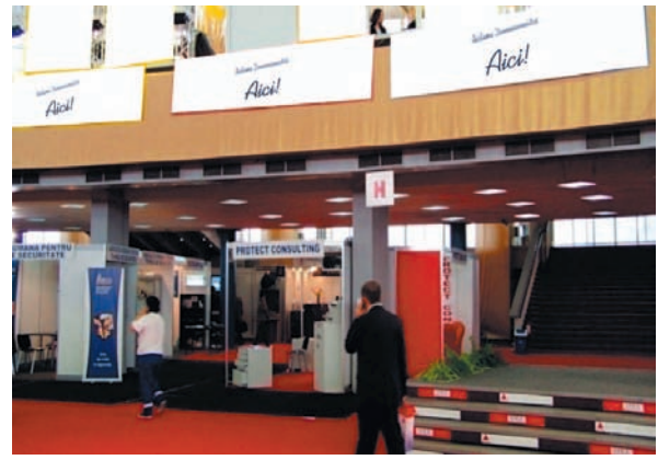
BANNER DISPLAY ON PAVILION A, FRIEZE 4.50